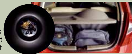
Tank capacity (water filling) – 34 litres

The company fitted Toroidal LPG tank is specially designed and is smartly located so that it does not use up much of the useful boot space.