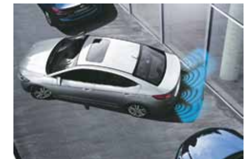
Rear Camera with 4 Parking Sensors