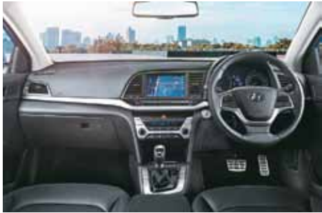
Driver Centric Ergonomic Design