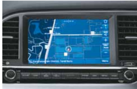
8.0 Smart Audio Video Navigation with Voice Recognition