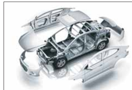
Strong Structure with 53% Advanced High Strength Steel