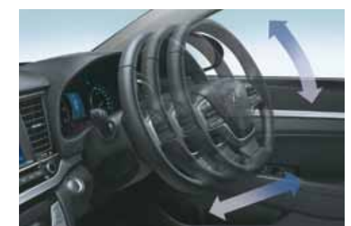
Tilt & Telescopic Steering