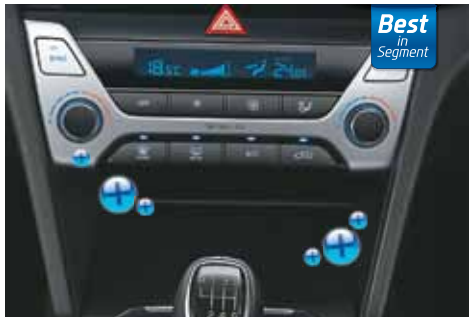
Dual Zone FATC with Cluster Ionizer