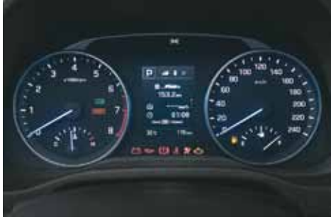
Advanced Supervision Cluster with Large 3.5 mono TFT Screen