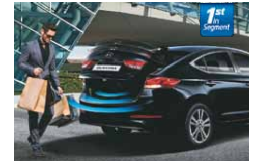
Hands Free Smart Trunk

Auto Defogger | Electro Chromic Mirror | USB Charger | Ski Pass Through