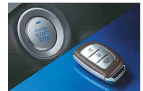
Smart Key and Push Button Start/Stop