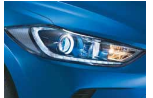
HID Headlamps with LED DRL