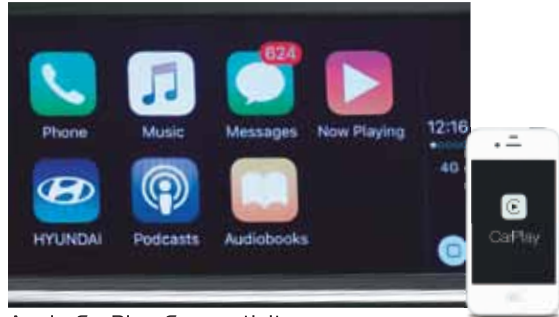
Apple CarPlay Connectivity