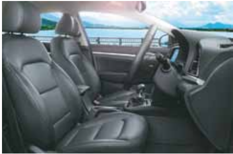
Premium Black Interiors with Leather* Seats