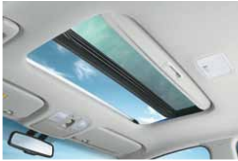
Smart Electric Sunroof