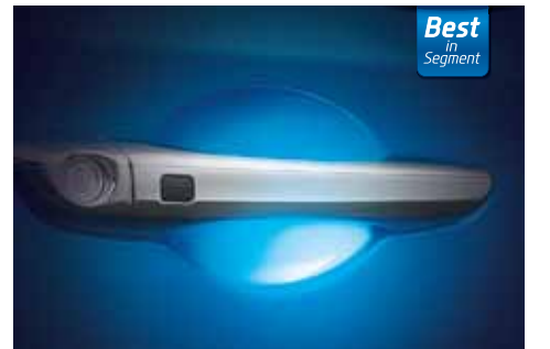
Chrome Door Handle with Pocket Light