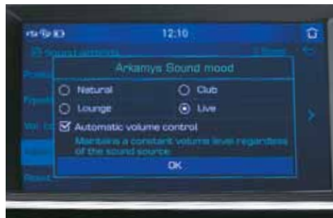
Arkamys Sound Mood