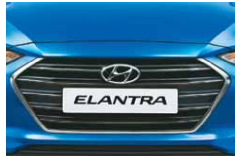
Imposing Chrome Grille