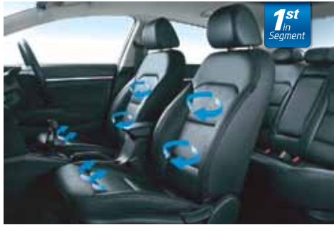
Front Seat Ventilation System