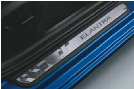
Premium Aluminium Scuff Plates