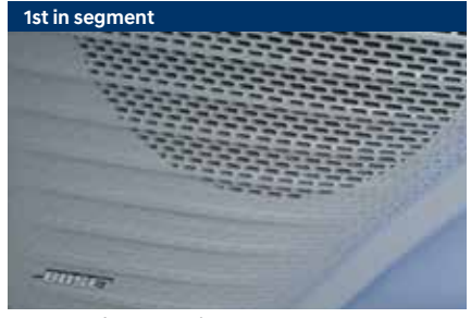
Bose premium 7 speaker system

Other features: 60+ Bluelink connected features (Best in segment) | Multi-language UI support (12 nos.) (1st in segment) | OTA updates for infotainment and map (1st in segment) | Home to car (H2C) with Alexa (English & Hindi) | Cruise control | Rear AC vents | Multi phone bluetooth connectivity (1st in segment)