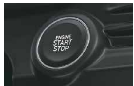
Push button start/stop